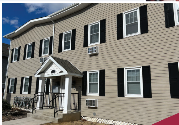
Mercy Haven's 65 th site!