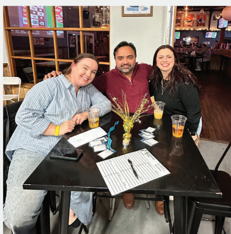
Trivia Night Fun!