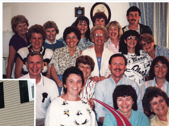
Our Founding Group of Volunteers - 1985

Here's to 40 years of hope, progress and community - and to the possibilities ahead!