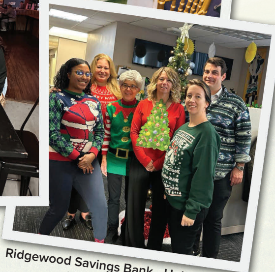
Ridgewood Savings Bank - Ugly Sweater Holiday Fundraiser