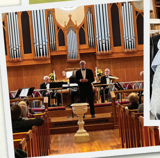
Long Island Brass Guild Fundraiser