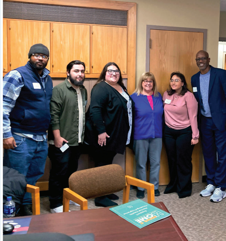
Staff, interns and residents meet with an Assembly Representative during Legislative Day visit in Albany.

We were grateful for the opportunity to advocate for not just our staff and residents but the 42,000 people receiving mental health housing across New York State.